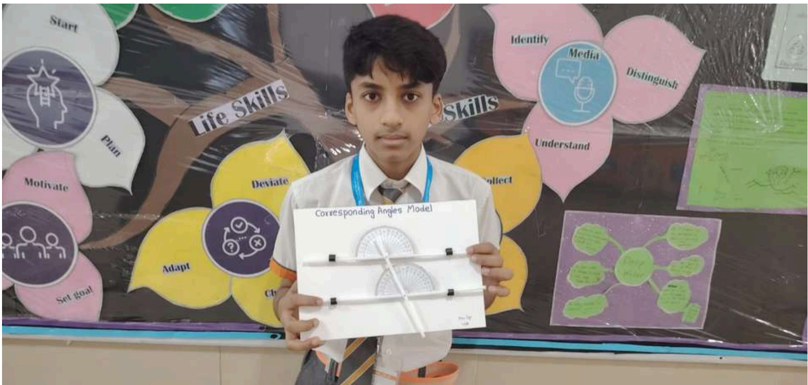
Working model of corresponding angles for display during the Math Week